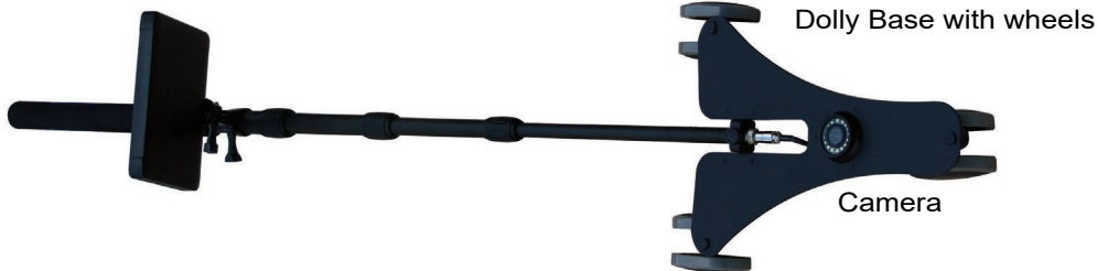
Dolly Camera Setup