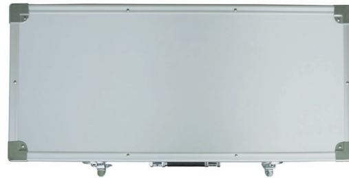
Ruggedized Aluminum Case