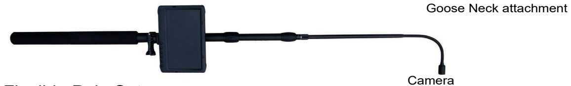
Flexible Pole Setup

Specifications subject to change without notice